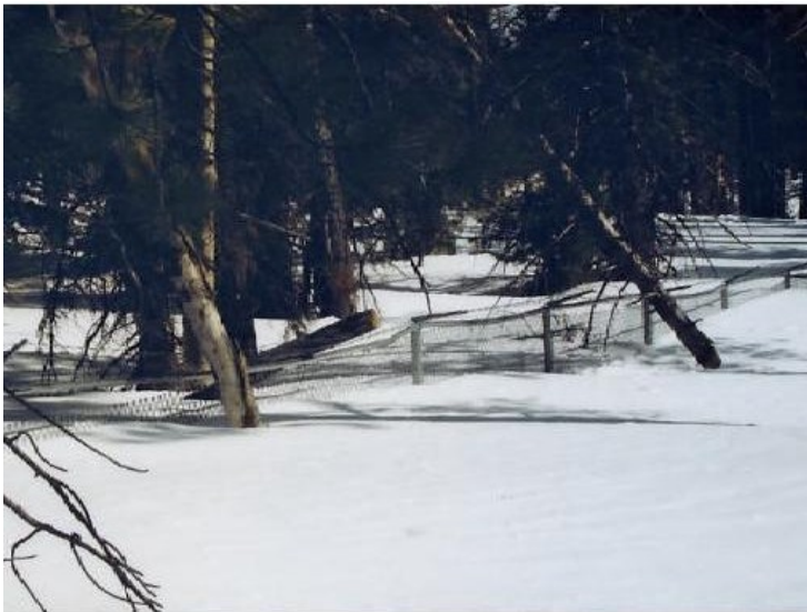
Snow buries 6 foot fence around tank. Fallen trees demolish portions of fence.

to the disaster declaration by Gov. Herbert, KCWCD was able to receive relief through FEMA (Federal Emergency Management Agency) to help recoup costs of repairs.